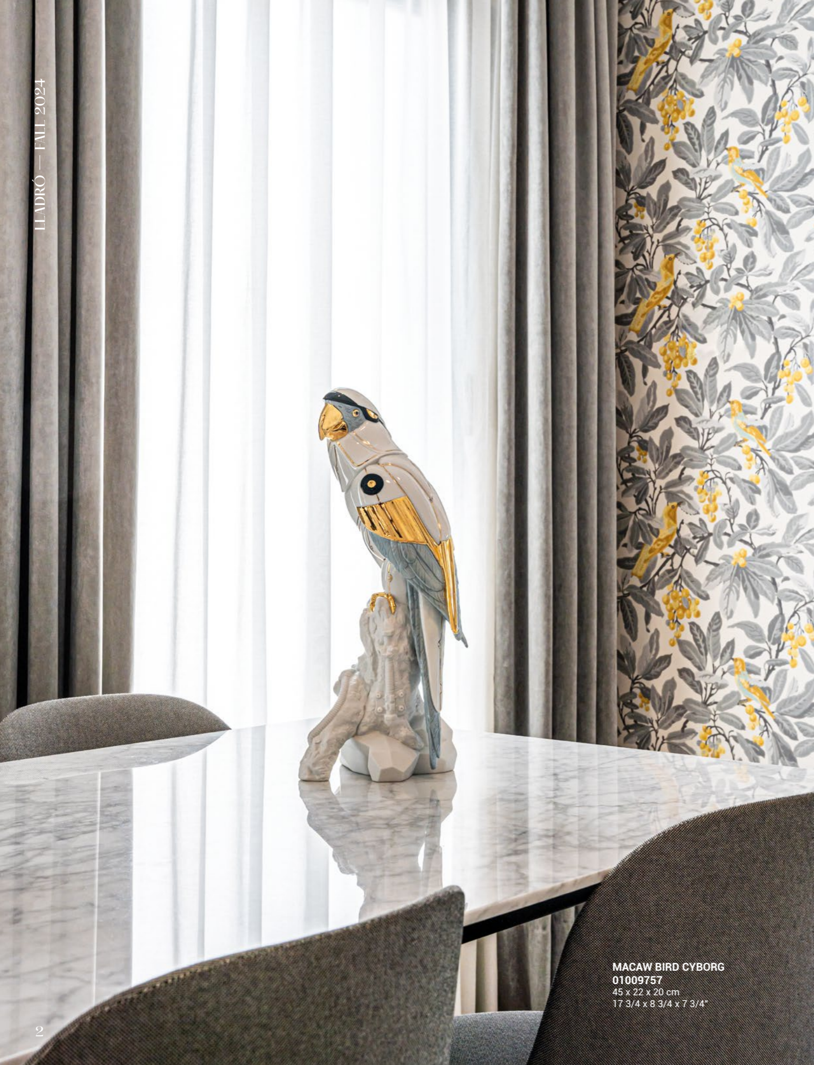
MACAW BIRD CYBORG 01009757 45 x 22 x 20 cm 17 3/4 x 8 3/4 x 7 3/4"