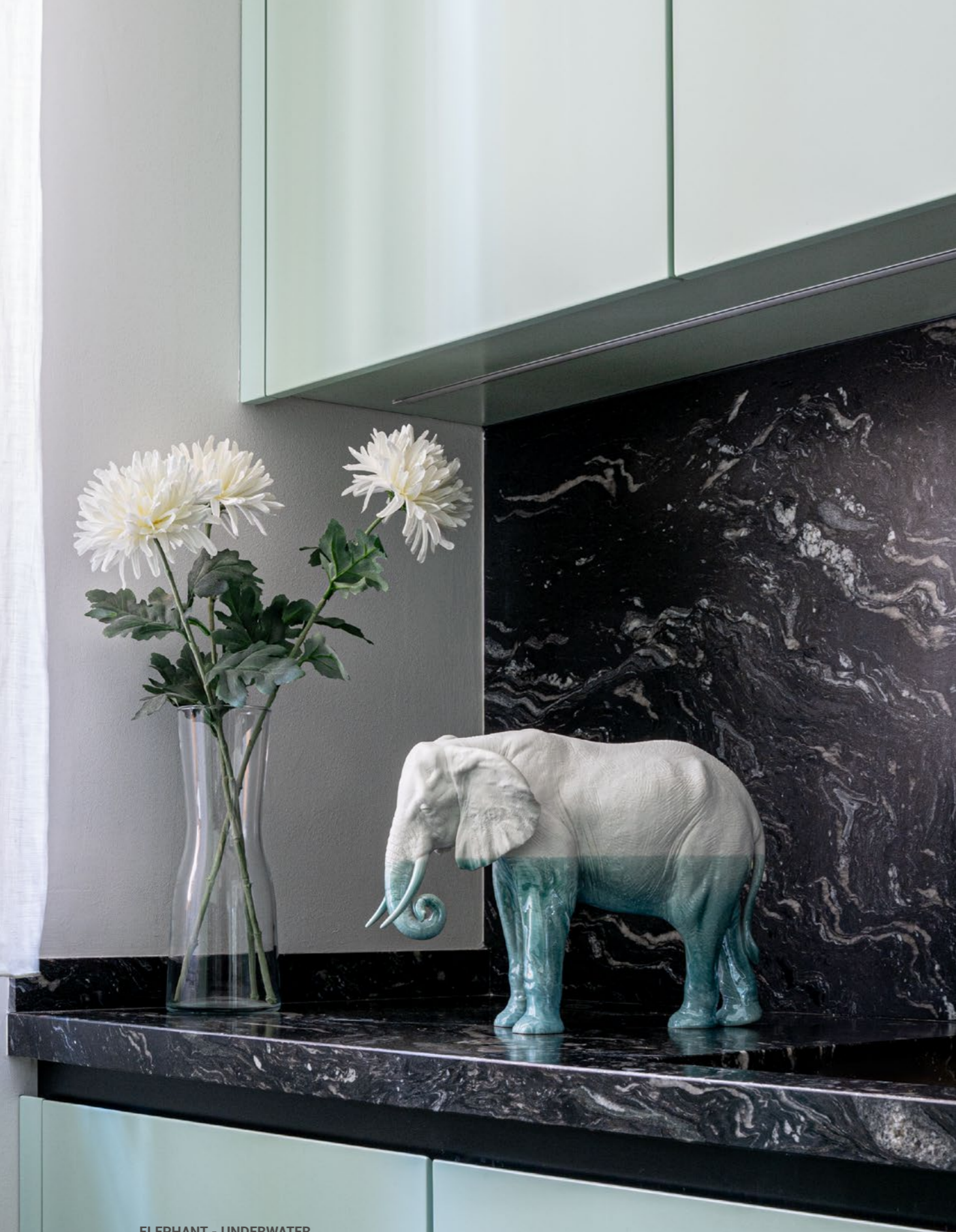
ELEPHANT - UNDERWATER 01009761 27 x 36 x 14 cm 10 3/4 x 14 1/4 x 5 1/2"