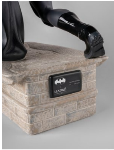
BATMAN™ 01009708 43 x 44 x 34 cm 17 x 17 1/4 x 13 1/2" Limited Edition of 500 units