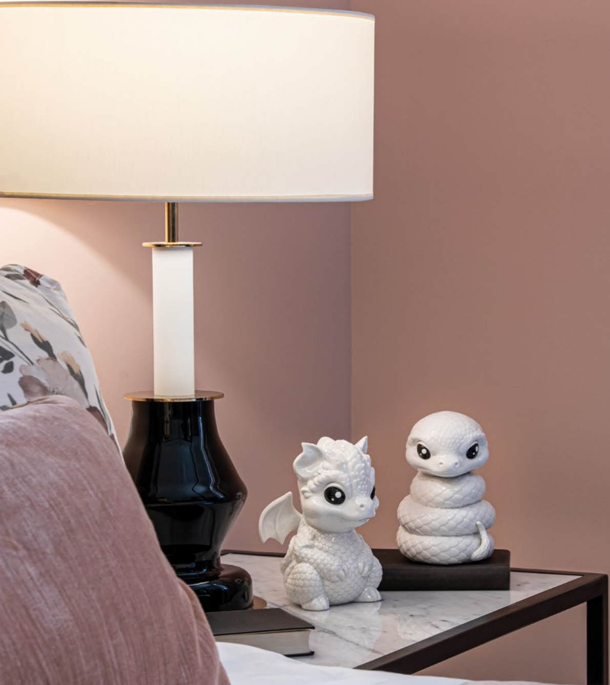
BABY DRAGON 01009766 18 x 11 x 13 cm 7 3/4 x 4 1/4 x 6 3/4"