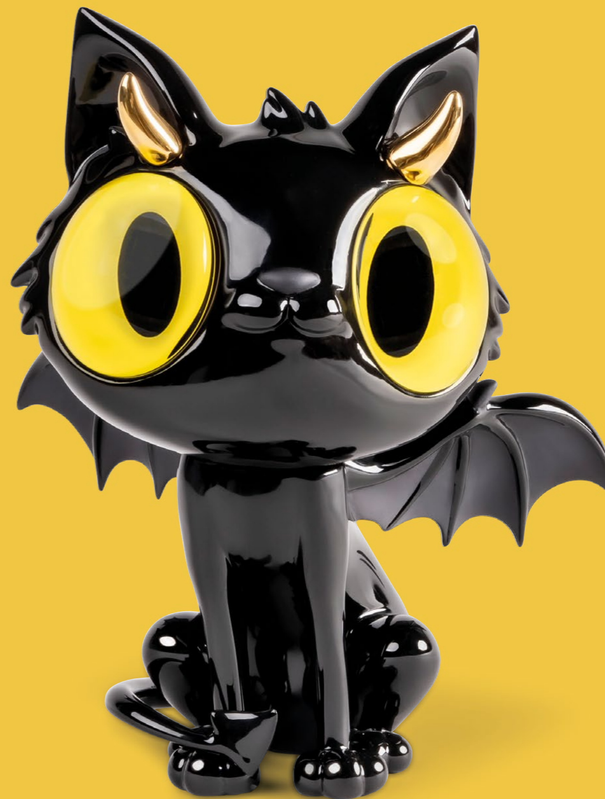
LITTLE DEVIL CAT 01050027 26 x 20 x 16 cm 10 1/4 x 7 3/4 x 6 1/4" Limited Edition of 1,500 units