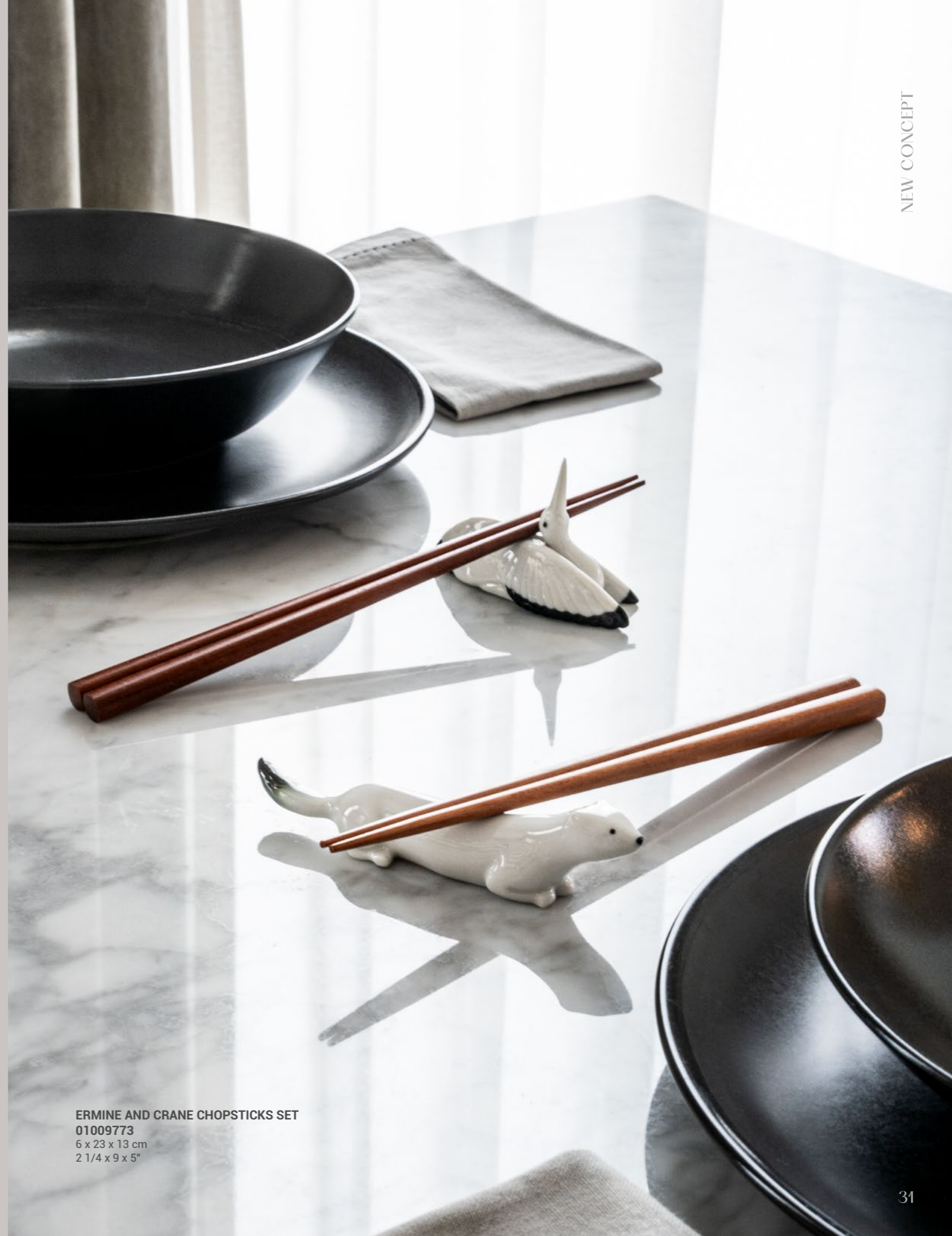
ERMINE AND CRANE CHOPSTICKS SET 01009773 6 x 23 x 13 cm 2 1/4 x 9 x 5"

Carpaccio Ermine and crane chopstick set portrays two of the animals that appear in "Young Knight in a Landscape". This painting by the Renaissance master from the Venetian school depicts a knight in armor posing in the middle of a richly decorated scene which includes another knight, buildings, plants and numerous animals, all represented with great detail and refinement. Two of these animals served as inspiration for our pieces: an ermine and a crane with elegant and stylized lines. The forms of the two animals act as chopstick rests in the fusion between aesthetics and functionality which is the signature trait of these two creations.