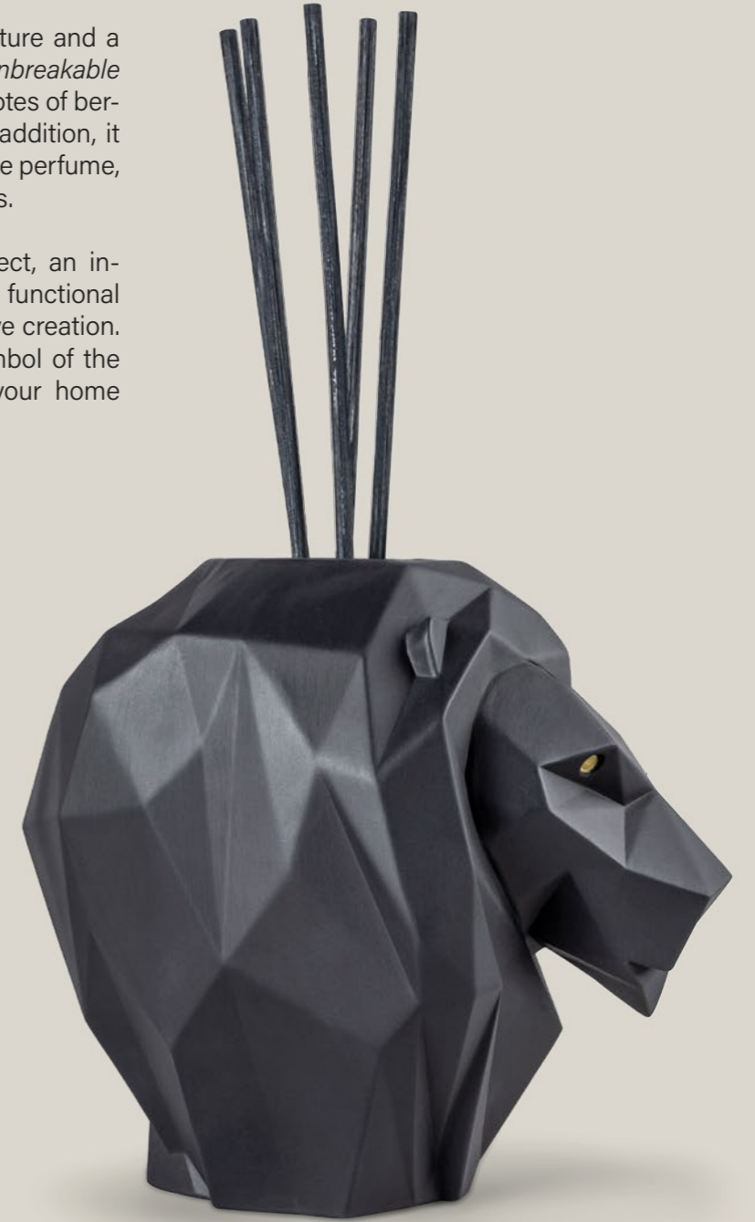
LION PERFUME DIFFUSER - UNBREAKABLE SPIRIT 01040311 18 x 14 x 20 cm 7 x 5 1/2 x 7 3/4"

Lion diffuser is a decorative object, an innovate and attractive design, a functional piece and an evocative, suggestive creation. It is both form and aroma, a symbol of the strength of nature that will fill your home with inspiration and energy.