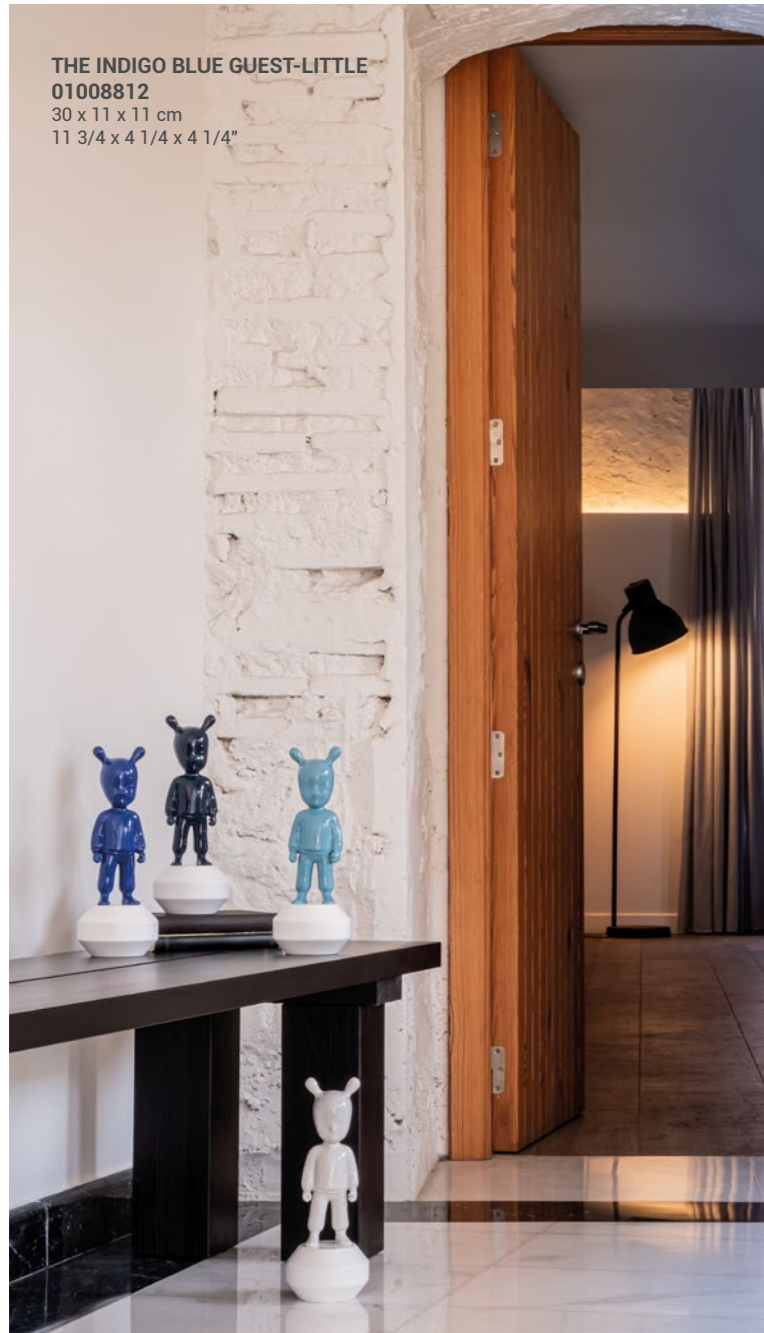
THE INDIGO BLUE GUEST-LITTLE 01008812 30 x 11 x 11 cm 11 3/4 x 4 1/4 x 4 1/4"