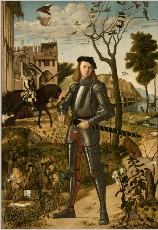
YOUNG KNIGHT IN A LANDSCAPE

We are presenting a collection of highly disparate porcelain pieces that nevertheless share the common feature of having been designed in collaboration with the Thyssen-Bornemisza National Museum. One of Spain's foremost art museums, it boasts one of the greatest collections of old masters of Western painting, with major works by Titian, Caravaggio, Rubens, Rembrandt, Monet, Degas, Cézanne, Van Gogh, Picasso, and Kandinsky, among a host of many others artists.