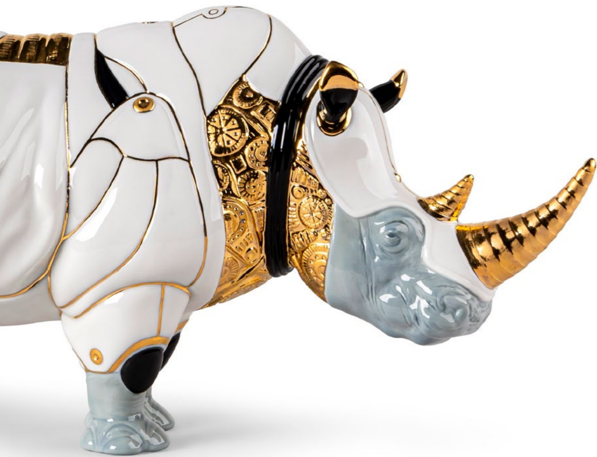
RHINO CYBORG 01009756 22 x 45 x 19 cm 8 3/4 x 17 3/4 x 7 1/2"

With pieces like these, the Cyborg Collection offers ideas conceived for interiors off the beaten track that are looking for different visions and decorations. Porcelain reinvents itself, offering a unique combination of tradition and modernism, nature and technology.