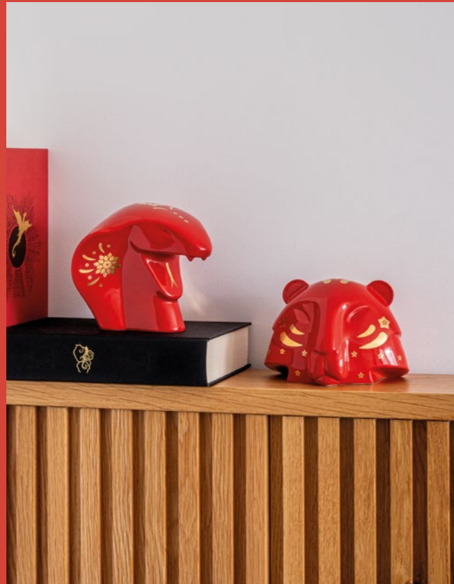
THE SNAKE (RED - GOLD) 01009760 13 x 15 x 14 cm 15 3/4 x 6 1/4 x 6 3/4"